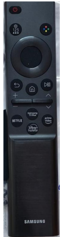
REMOTE FOR SAMSUNG MONITOR