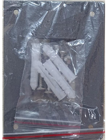
STAND FOR CPE