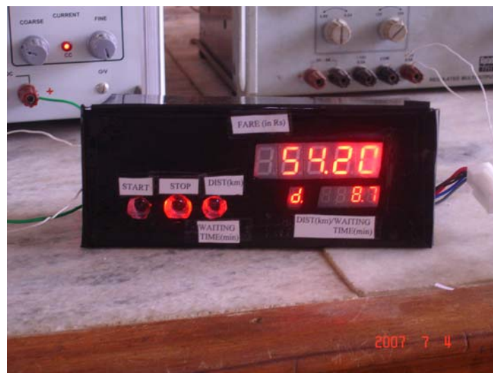
Customer Display Unit

The drivers of the autorickshaws used to employ the analog autometers in the near past. But these can not be easily recalibrated whenever the tariff rates change. Due to the fluctuations of the price of fuel, the tariff changes quite often. Also, the government of Tamilnadu has mandated that only the electronic autometers should be used. Hence, there was a need for inexpensive autometers which the team decided to fulfill.