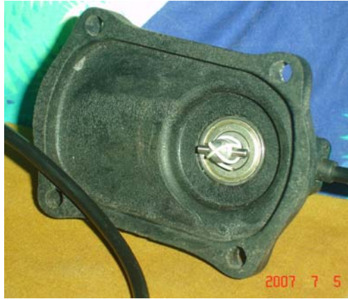
Wheel Tachometer Unit

The estimated market price of this autometer is Rs. 1500. This is much lower than the ones currently available in the market.